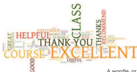
A wordle, or word cloud, filled with comments about the NIH Library’s bioinformatics training.